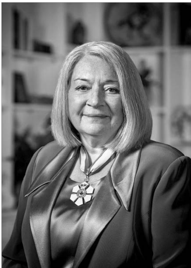
Her Excellency the Right Honourable Mary Simon, Governor General and Commander-in-Chief of Canada

THE GOVERNOR GENERAL · LA GOUVERNEURE GÉNÉRALE